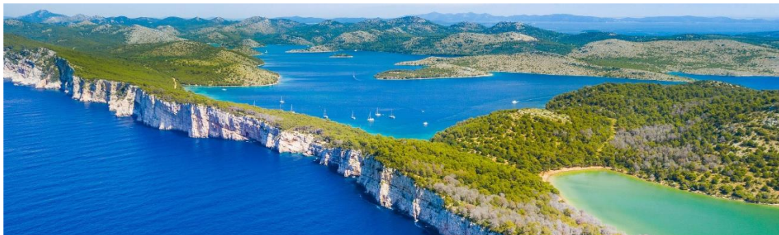
Telašćica Bay – a natural paradise on Dugi Otok

Located on the southeastern coast of Dugi Otok, Telašćica Bay is surrounded by 13 islands and islets, with six small islets within the bay itself. Protected as a Nature Park, it captivates visitors with a mix of tranquil beaches, steep cliffs, dense pine forests, and Mediterranean meadows. Highlights include a unique natural harbor with 25 small beaches, cliffs rising up to 161 m, and the healing saltwater lake "Mir." It's the perfect destination for nature lovers, hiking, diving, and relaxing in pristine surroundings.